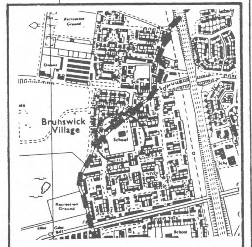
Location plan 1:10,000