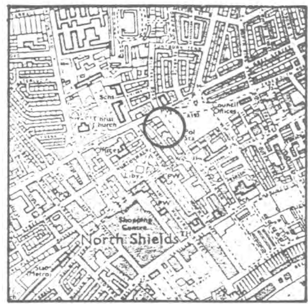
LOCATION PLAN 1:10,000