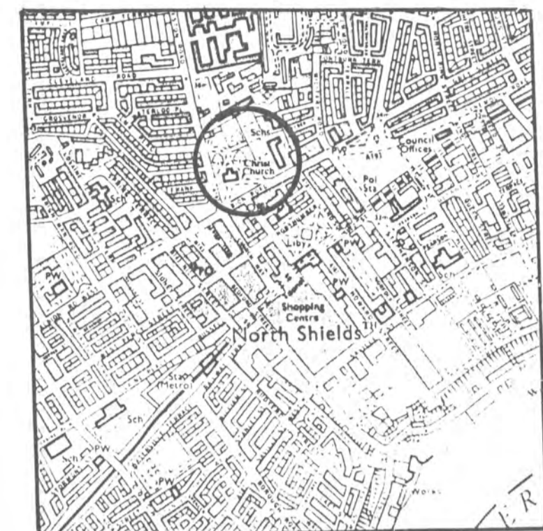
LOCATION PLAN. 1:10,000