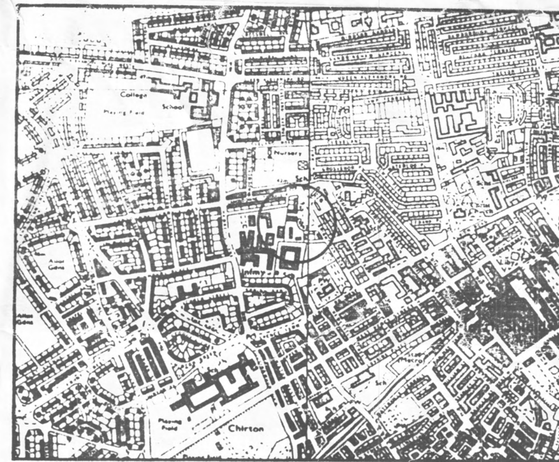
LOCATION PLAN 1:10,000