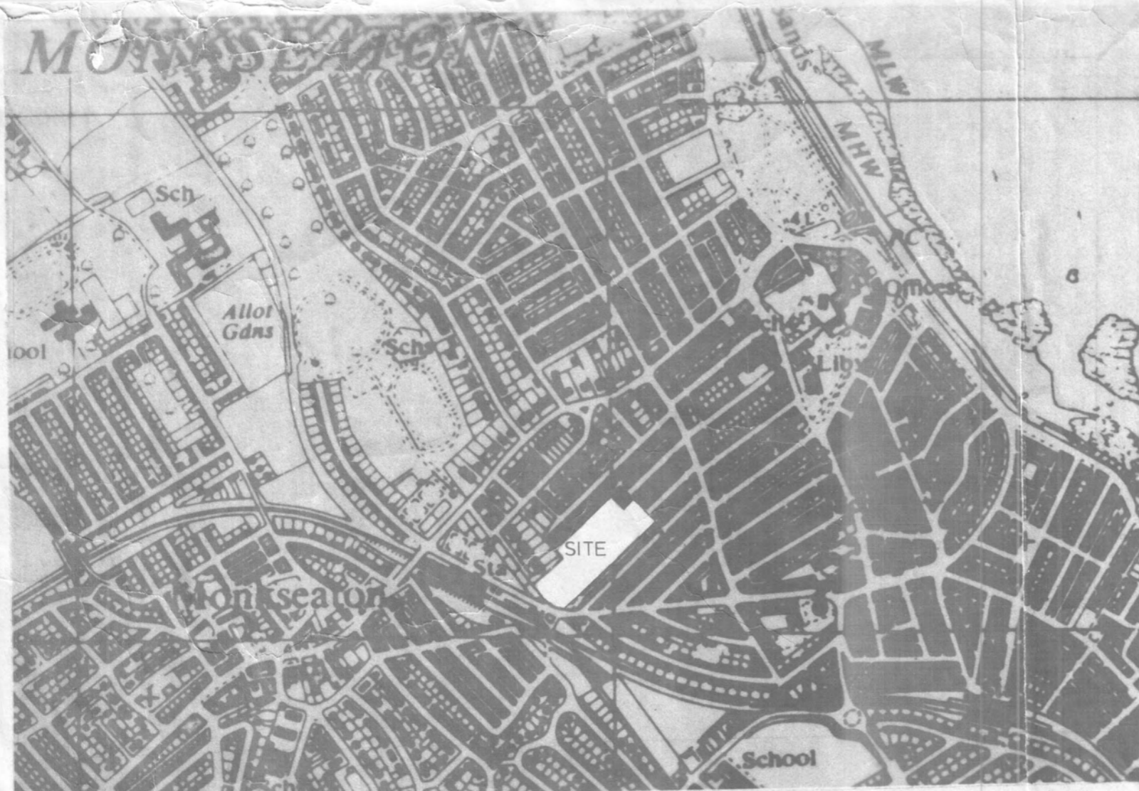
LOCATION MAP 1:10,000