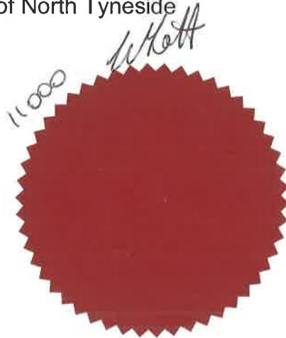
Chair of the Council

The Common Seal of the Council of the Borough of North Tyneside was affixed to this order in the presence of: