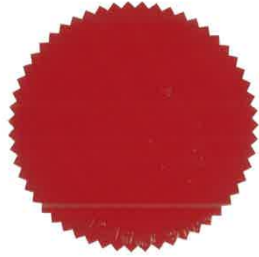
Chair of the Council

The Common Seal of the Council of the Borough of North Tyneside was affixed to this order in the presence of: