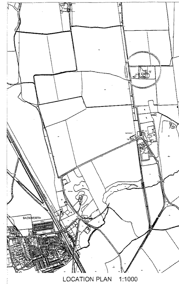
LOCATION PLAN 1:1000