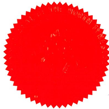
Chair of the Council

THE COMMON SEAL of the ) COUNCIL OF THE BOROUGH OF ) NORTH TYNESIDE was hereunto ) affixed this 22 nd day of September ) in the presence of: )