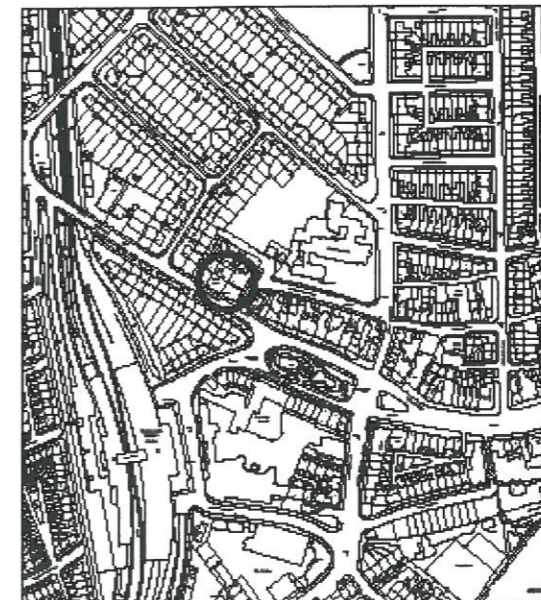
Location plan 1:5000