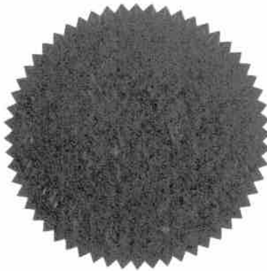
Chair of the Council

THE COMMON SEAL of the ) COUNCIL OF THE BOROUGH OF ) NORTH TYNESIDE was hereunto ) affixed this 1 st day of July 2010 ) in the presence of: )